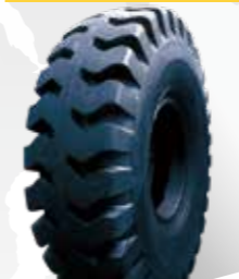
E-4B / E-4B PA