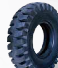
E-4D / E-4D